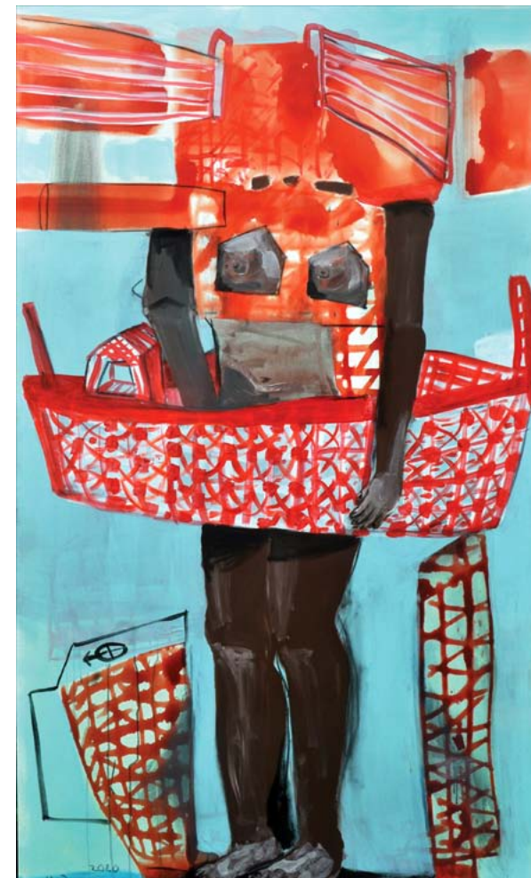
Mella Jaarsma Pasang II charcoal, acrylic on canvas 200 x 120 cm, 2020