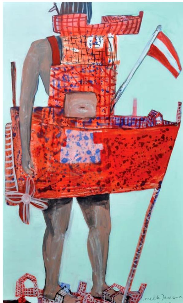
Mella Jaarsma Pasang I charcoal, acrylic on canvas 200 x 120 cm, 2020