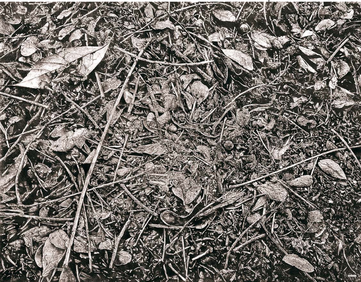
Bambang BP Sebidang Kisah pencil on canvas 114 x 143 cm, 2020