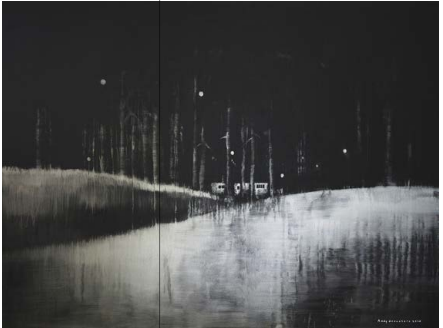
Andy Dewantoro FOREST UNKNOWN #6 acrylic on canvas 180 x 240 cm, 2010