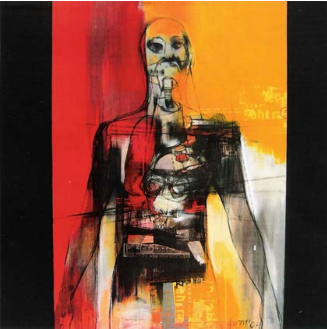
Arin Dwi Hartanto Redefining The Human Body acrylic, charcoal, silk screen on canvas 150 x 150 cm, 2004