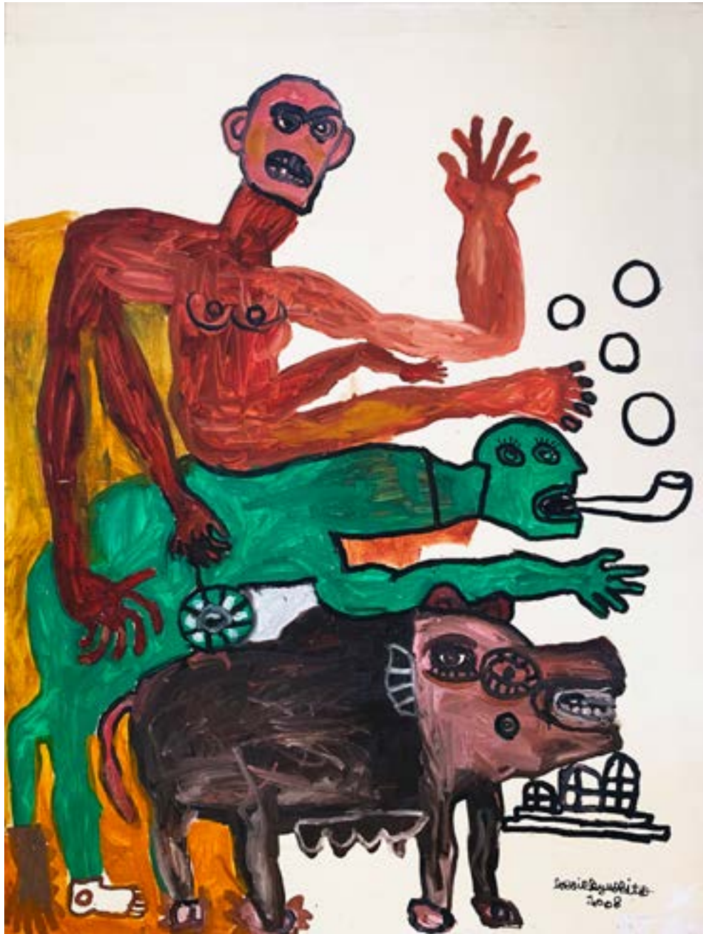
Bob Sick Java Trojan acrylic on canvas 200 x 150 cm, 2007