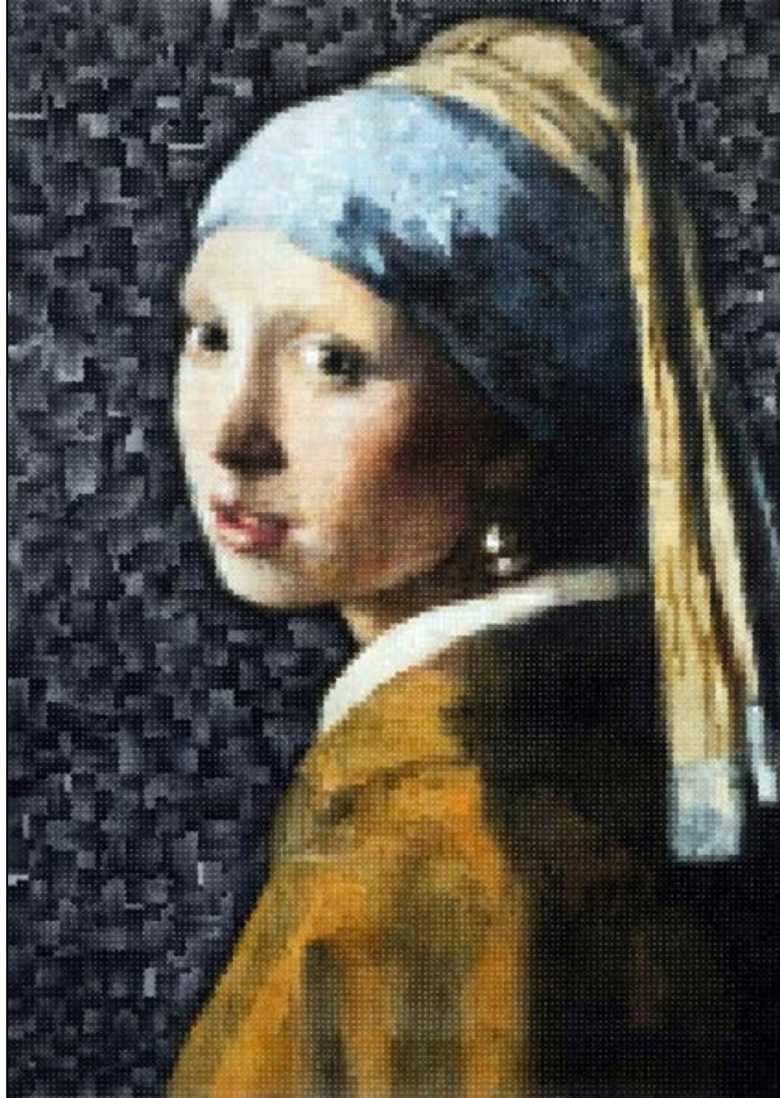
Dadang Rukmana Portrait of Griet arches aquarel paper, iridescent medium, liquid water color & pencil 154 x 112 cm, 2015