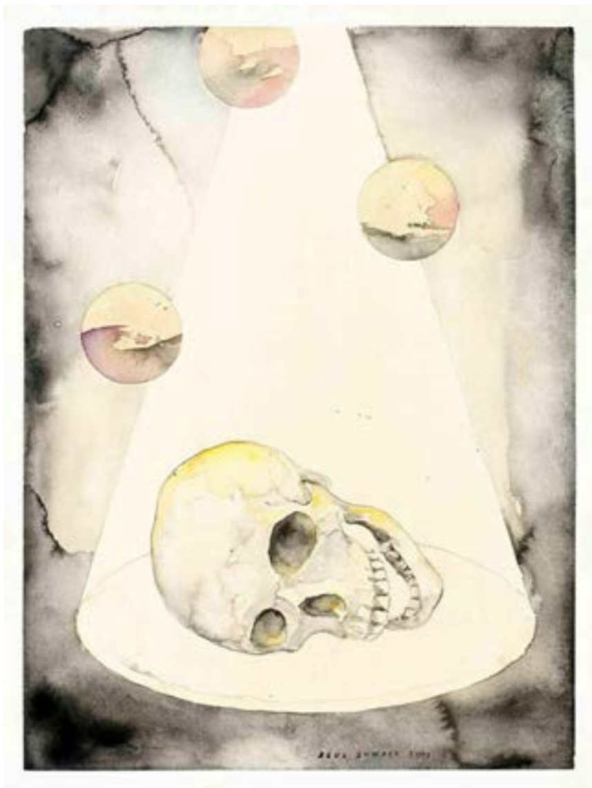
Agus Suwage The Beginning watercolor & tobacco juice on paper 67 x 57 cm, 2009