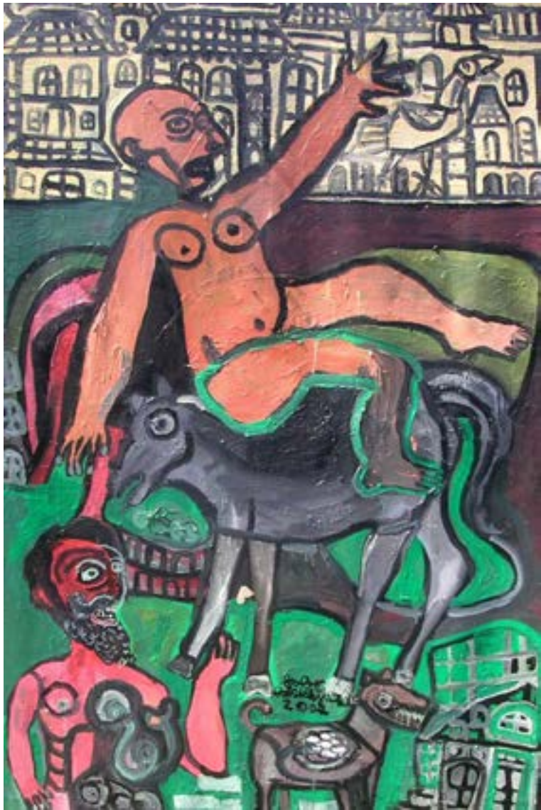
Bob Sick City Park oil on canvas 150 x 100 cm, 2007