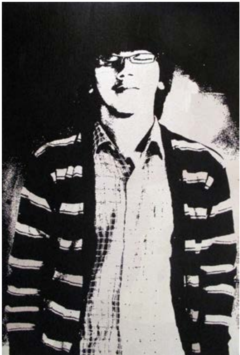
Erik Pauhrizi Untitled embroidery on canvas 185 x 120 cm, 2010