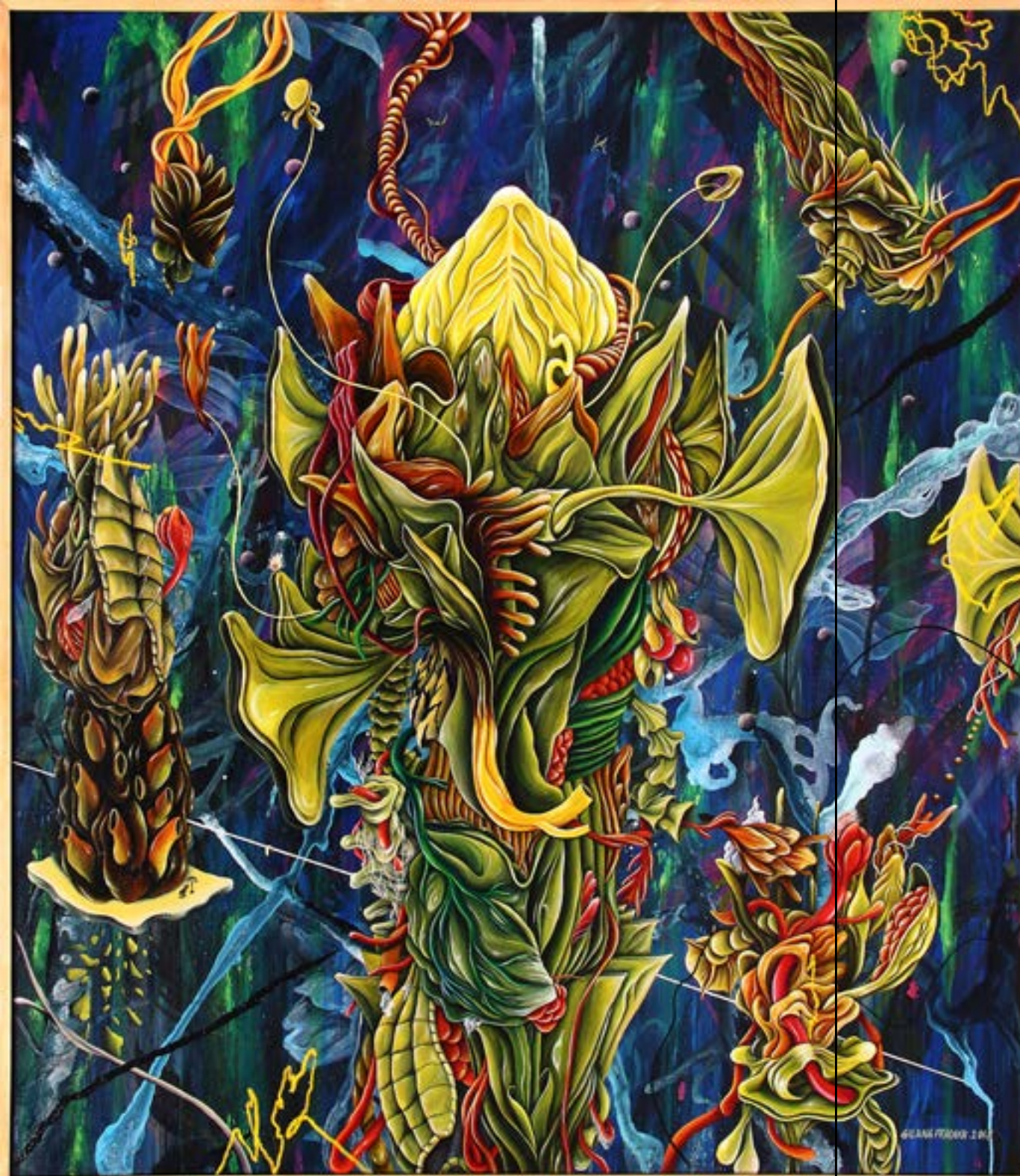
Gilang Fradika Relics #2

acrylic, spray paint, oil bar, medium gel on canvas 200 x 175 cm, 2018