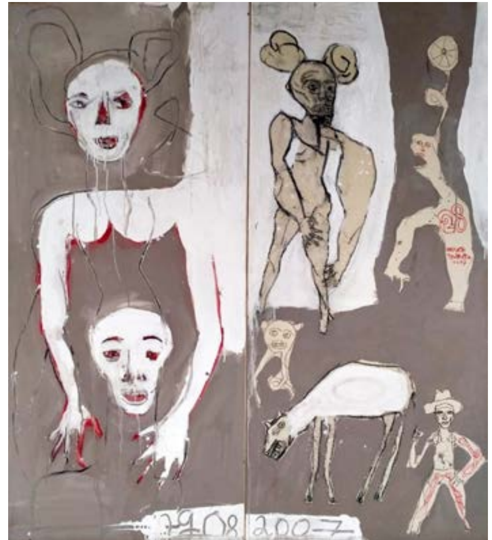
Bob Sick Morning Sickness acrylic on canvas 180 x 160 cm, 2007