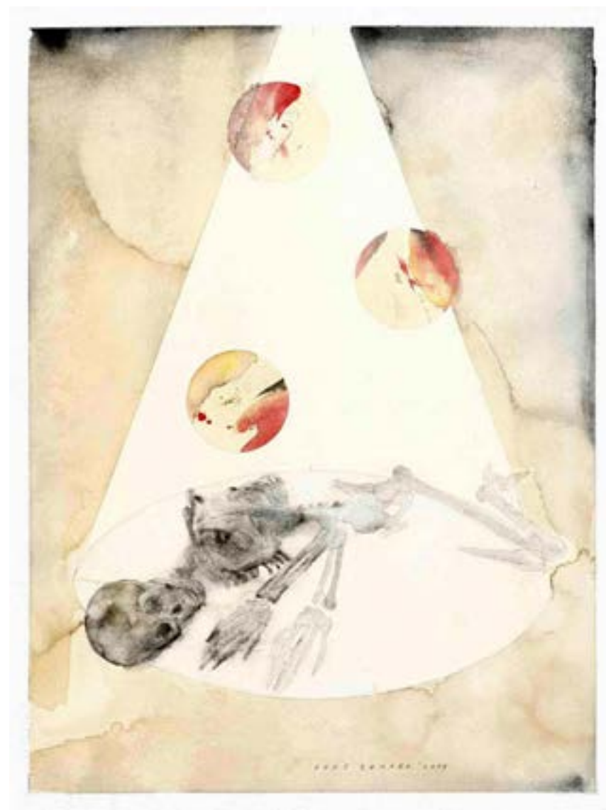
Agus Suwage The End watercolor & tobacco juice on paper 67 x 57 cm, 2009