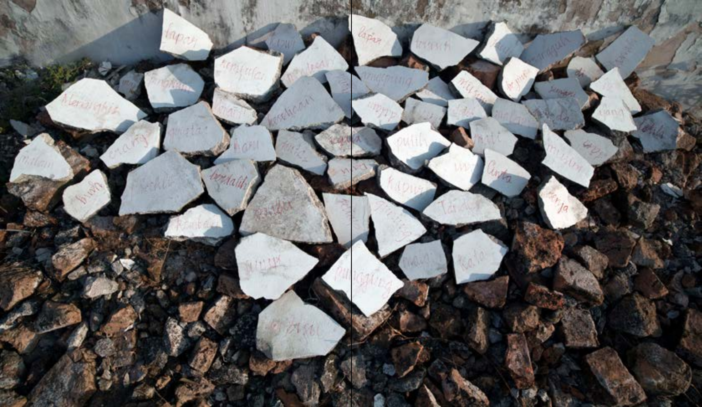
Wimo Ambala Bayang Dua Surat Tentang Lapar digital c print on fuji professional paper mounted on aluminium 85 x 150 cm, 2011