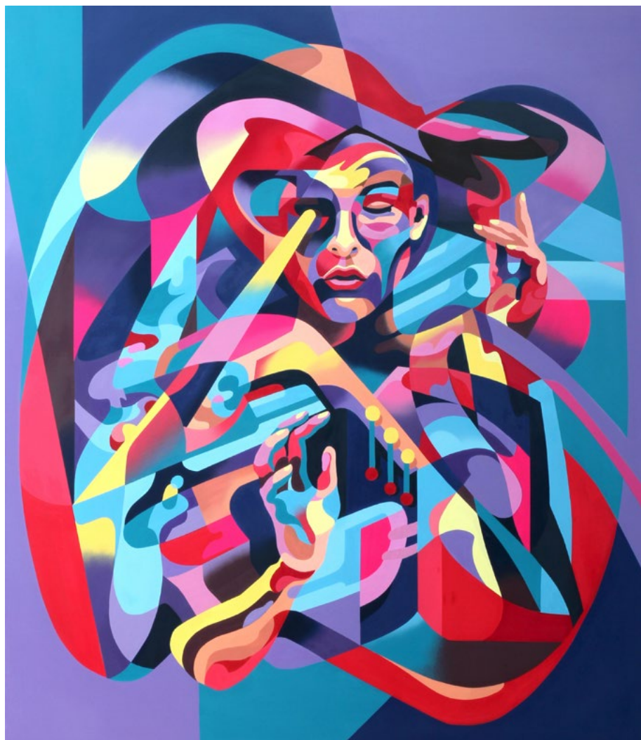
TUTU Theatre of Mind

aerosol paint on canvas 150 x 130 cm 2022