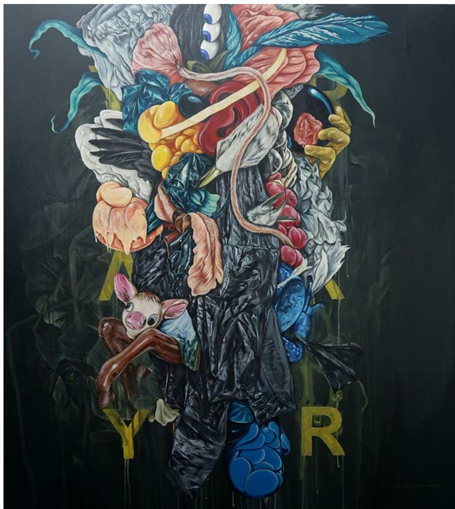
GILANG FRADIKA Year After Year

gel, acrylic on canvas 150 x 135 cm 2020